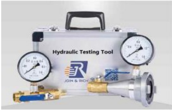
Fire Hydrant Testing Tool