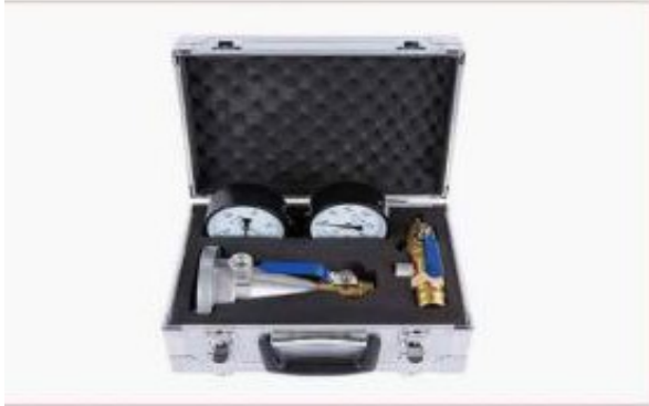
Fire Sprinkle Testing Tool